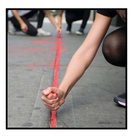
Post 6. Link/Image: <a href="https://redsandproject.org/sidewalk-installations/">https://redsandproject.org/sidewalk-installations/</a>

The Red Sand Project is a free and easy way to gather a group in your community to raise awareness by creating a sidewalk installation. Make sure to share your event on social media #RedSandProject to connect to thousands of others worldwide. Order your sand for free HERE.